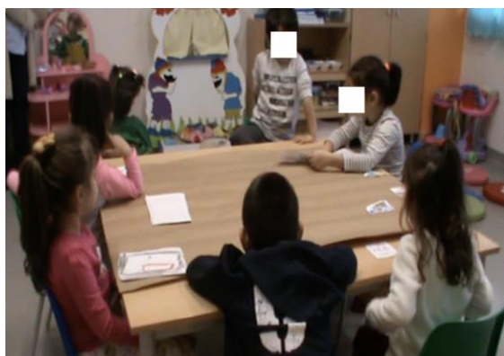
Photograph 2: Relating the classroom and the map

The children had no difficulty seeing the similarities between the classroom and the paper, as they had earlier experience with maps (Photograph 2).