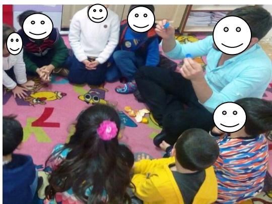
Photograph 1. Sink or Swim Activity

He further stated that “Activities trigger children’s curiosity are always more successful.”