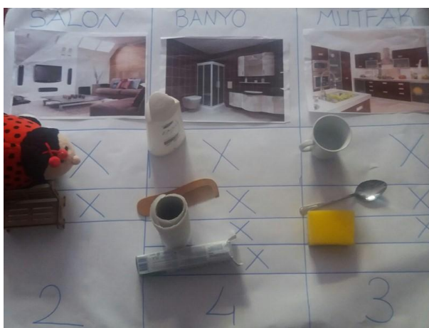
Figure 3. Objects in Parts of the House

Objects in parts of the house, was the last activity used in the study. In this activity, children constructed a picture graph (Figure 3). Children matched the object photos with the column they belong on the graph prepared by the teacher. Then, they discussed which room has more objects and which room has fewer objects. The teacher evaluated graph with children and finished the activity with a song. Overall, during the activity children were engaged in, tried to answer open-ended questions, and assisted the teacher while constructing the graph.