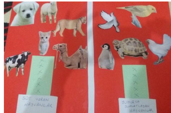
Figure 1. Egg Laying and Milk Giving Animals Graph

The first activity was egg laying and milk giving animals. At the egg laying and milk giving animals activity, most of the children had the basic information about the animals and they could divide the data into two groups as egg laying and milk giving animals. The pre-service teacher provided children with animal photos and also the graph offers necessary clues to children (Figure 1). Even if they couldn't calculate the total numbers for each group, they could make a comparison between the bars and decide whether the bar constructed for egg laying animals is taller than the bar for milk giving animals, or not.