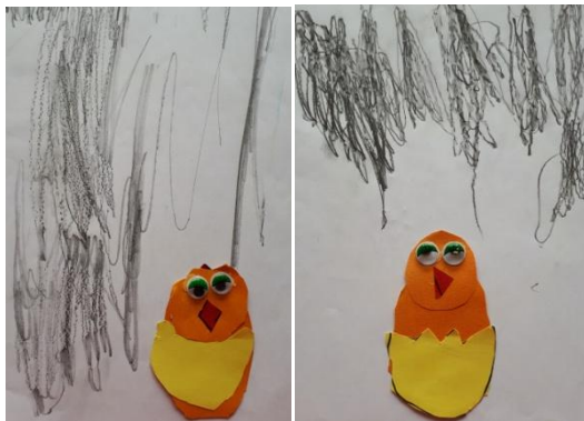
Photograph 1. Samples of Copying and Chick Activity

Making copy. Both the chick and making copy activity in Photograph 1 belongs to the same children. On the left, the child copied the surface of the iron door whereas in the right one, another child copied the tree trunk. There is freedom and difference in children's choices and works in copying activity, yet the products of chick activity resemble each other.