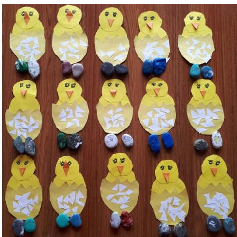
Photograph 3. Samples of Stone Painting and Chick Activity

Stone painting. The stone painting work was combined with a game; therefore, compared to other activities, the children were more interested in this activity compared to the chick activity.