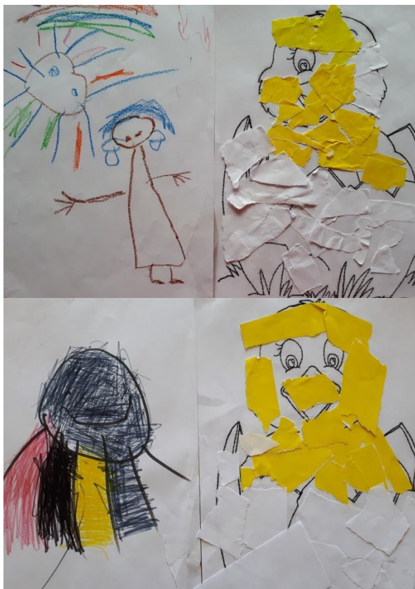
Photograph 5. Samples of Painting the Ceiling and Chick Activity

When asked which of the art activities the children were doing was more beautiful, students used expressions such as “My sea vehicle is lovely”, “My mermaid is beautiful. I liked it very much” or “My picture is beautiful.” Thus, they showed that they formed a belonging to their products. None of the 96 children who participated in the study used possession expression for the chick product. They may have liked this activity more because they perceived the activity of making a picture under the table as a game.