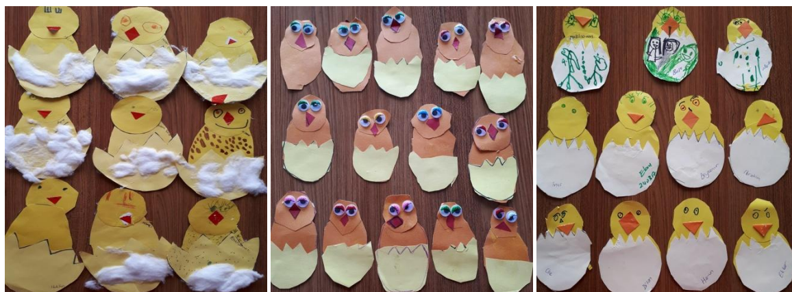
Photograph 7. Samples of Chick Activity