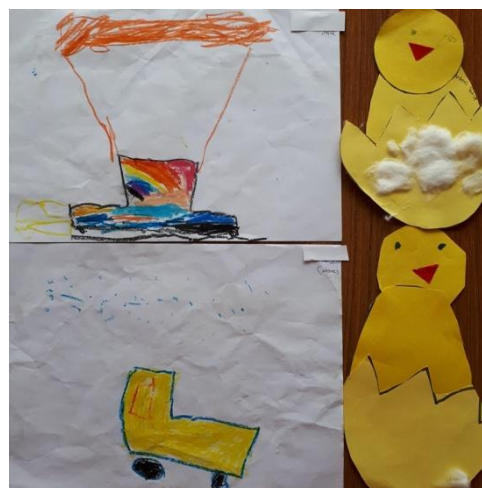
Photograph 4. Samples of Shadow Drawing and Chick Activity

it more beautiful expressed that they wanted to do shadow activity when asked which of the two activities they would like to do next day.