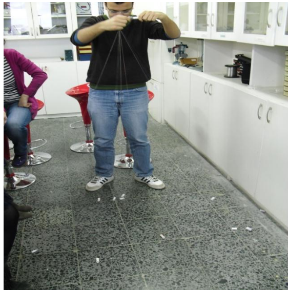
Figure 1. Chaotic Motion of Thread Cones

For this inquiry, the chaotic system we focus on consists of two main parts; thread cones with rope and a pencil to reel up the rope. For one thread cone it is possible to observe predictable motion while one is reeling up the rope. But, with ten thread cones, the motion becomes chaotic (Figure 1). A video which demonstrates the chaotic motion of thread cone is available at: http://youtu.be/FKkzsRBR_8w